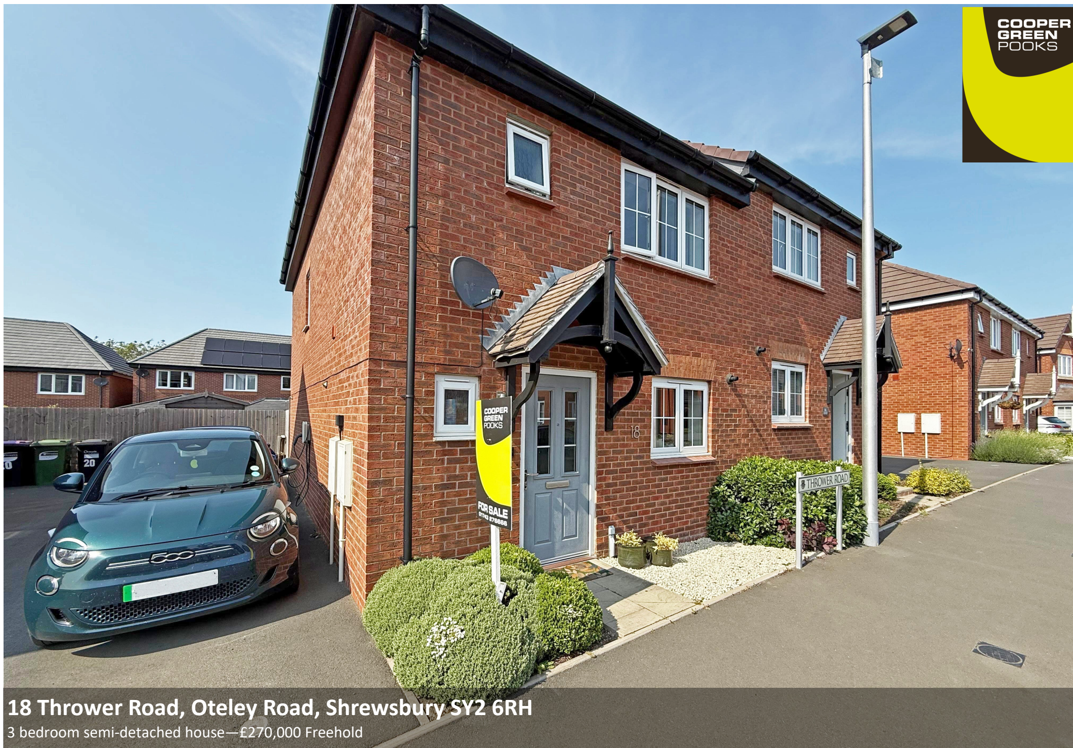
18 Thrower Road, Oteley Road, Shrewsbury SY2 6RH

3 bedroom semi-detached house—£270,000 Freehold